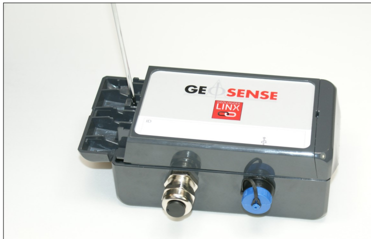
2. Push down hard with the screwdriver. This will open the quick-release latch