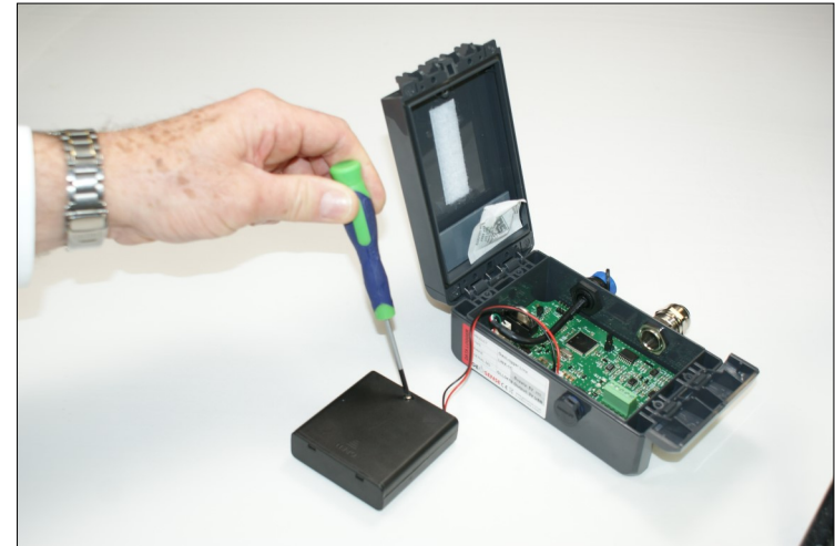
3. Remove the battery holder, undo the screw securing the lid and fit the batteries