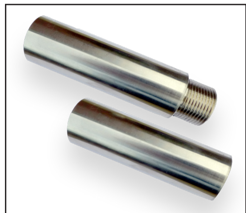
Drive-in adaptors, pictured above, with 1" BSPM thread or plain ended can be used to connect to drill rods.

Dynamic pore pressure monitoring (Strain Gauge version only)